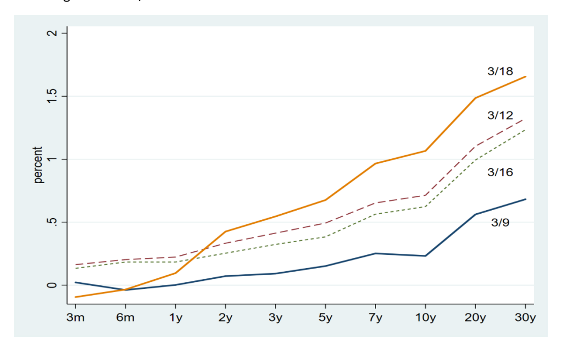
Figure 1 caption. U.S. Treasury yield curve rates ranging from 3 month to 30 years , minus the 3-month Overnight Interest Swap (OIS) which proxies the market expectation of federal funds rate in the next three months. We plot curves on four different days, Mar 9<sup>th</sup>, Mar 12<sup>th</sup>, Mar 16<sup>th</sup>, and Mar 18<sup>th</sup>, when the U.S. stock market experienced four market-wide trading halts due to circuit breaker rules.